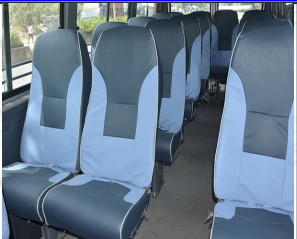
Tempo Traveller Seat